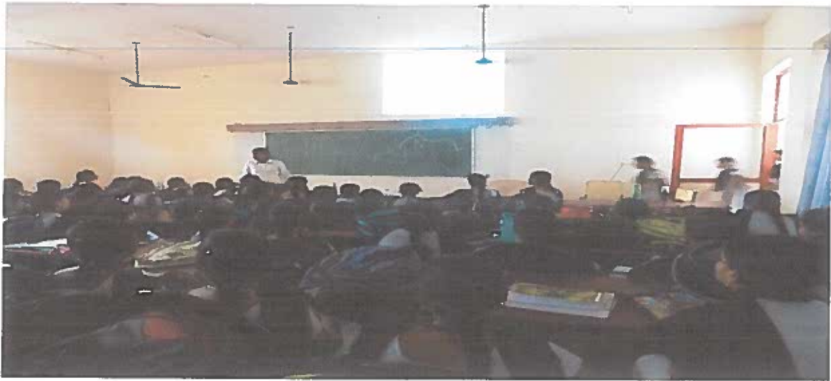
GATE Training classes by 'Engineers Hub'- Faculty

Ph: 9133300357, 8886066339 :: Fax: 0891-2010487 :: E-Mail: viewprincipal@gmail.com